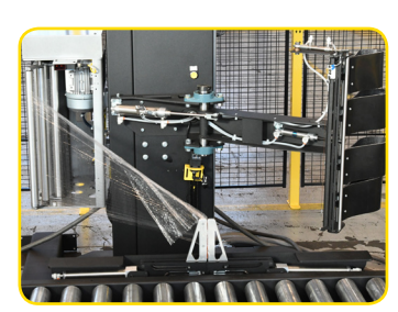
Film Clamp/Cut/Wipe Assembly