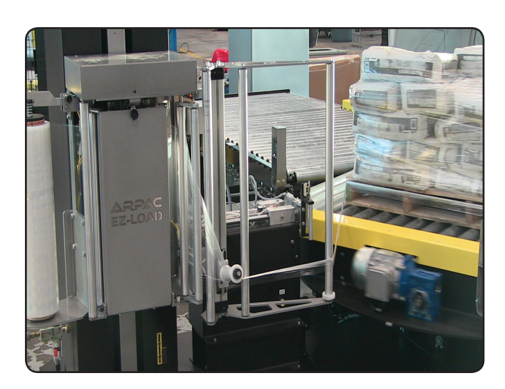
Optional Automatic Roping Device

The PAC-SERIES can be manufactured with several performance enhancements. The Roping device is used as a replacement for belly straps and stabilizes the load, and a Top Sheet Dispenser covers the top of the pallet with film, for additional product protection from moisture.